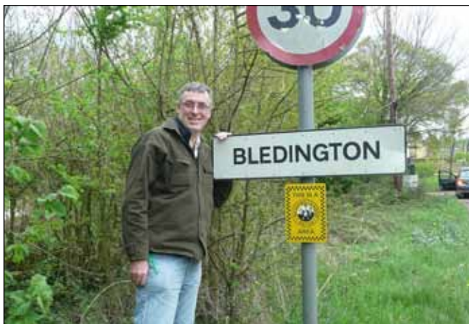
Is the Morris Spirit here?

For a while I settled on a wishy-washy, yet, non-threatening set of