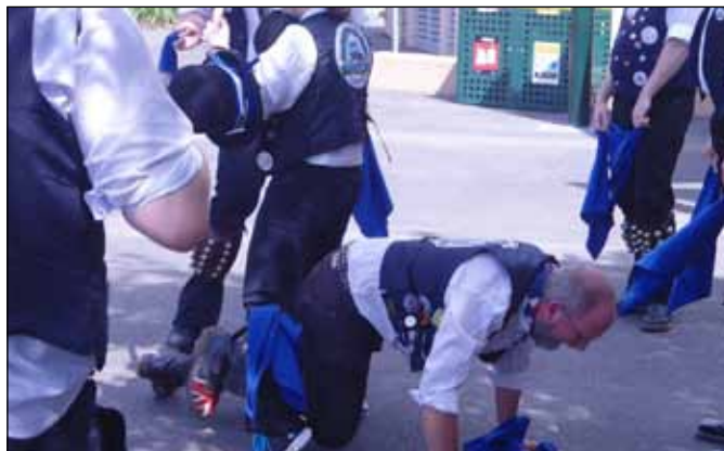
Well, what can one say?