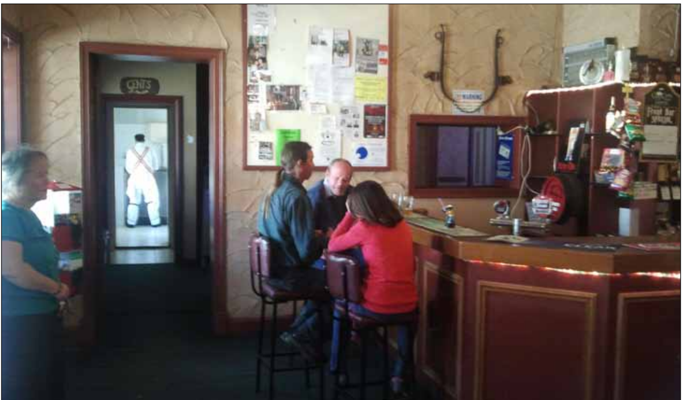
What is wrong with this pic?