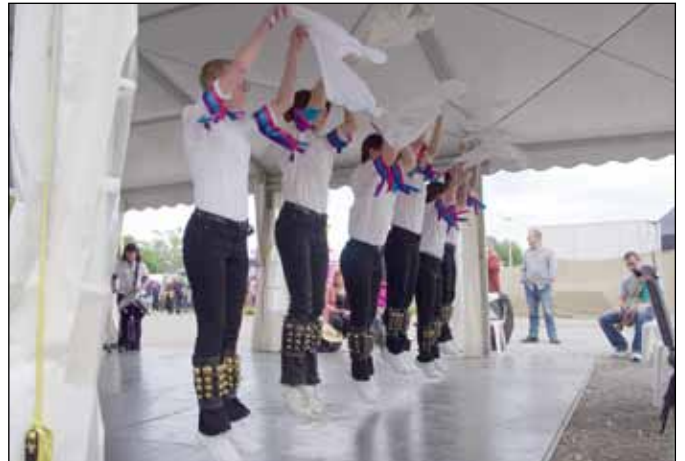
Up we go... 'Banana Splits' at Fleurieu