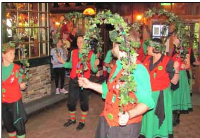
Brandragon at the Steam Ale ▲