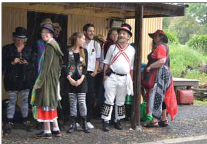
All good fun despite the weather.