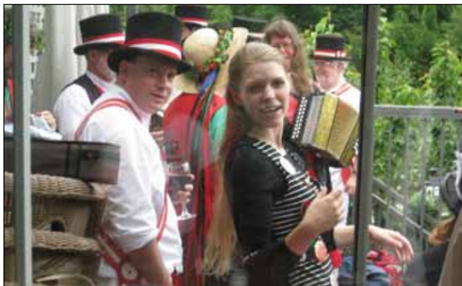
Did the Squire say free beer?