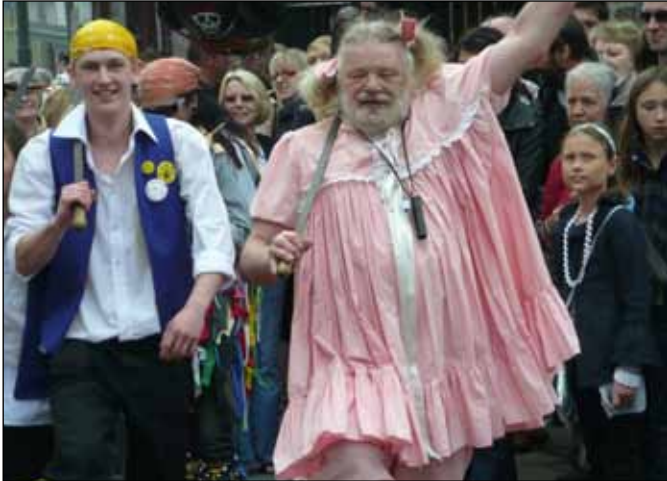
I'm sure it's not here...