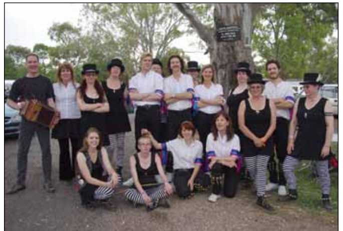
Hedgies and Hoffers at Fleurieu Folk Festival