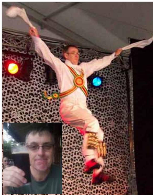
It must be in here somewhere!

Its a bit like Gaia theory, but deeply embedded inside a cultural context. A human context. You and I know plenty of morris folk who are complete cynics, people who are over the top, logical, sensible people. People who are well-grounded, insightful, intelligent and pretty much a force to be reckoned with. You are probably one yourself? Don't you find it a bit odd that you feel so passionate about donning a ridiculous getup and seriously prancing about to a folk tradition that is locked onto a foreign culture? If you haven't thought about it before, perhaps you should bust a few neurons on the subject? Why should you care about perfecting a certain figure, step or movement in morris? And when I mean "care" I am not referring to, say, having a preference for one brand of shampoo over another. I mean care in the sense