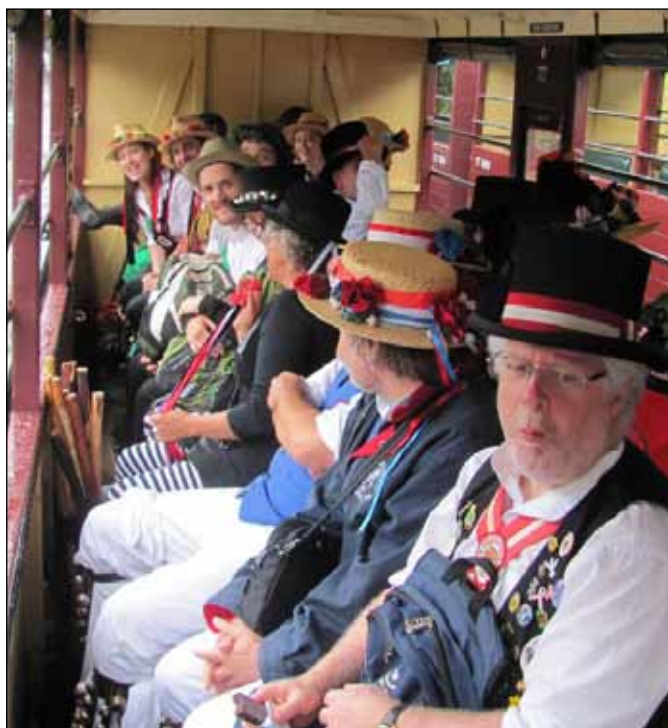
We're on the train!