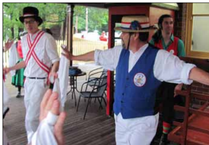
Room Room I pray, give me some room!