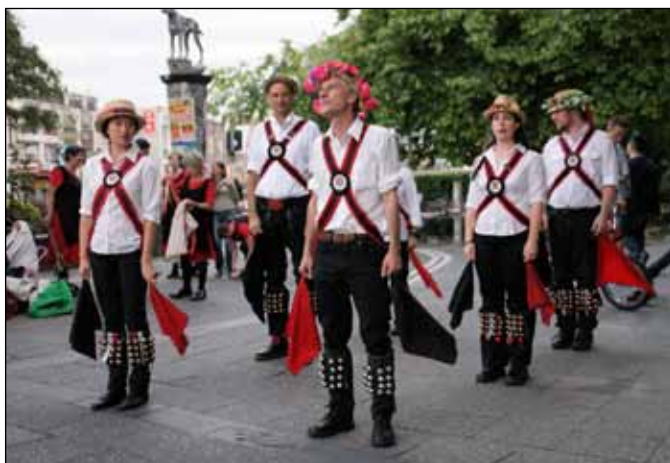
Now, how does this dance go?