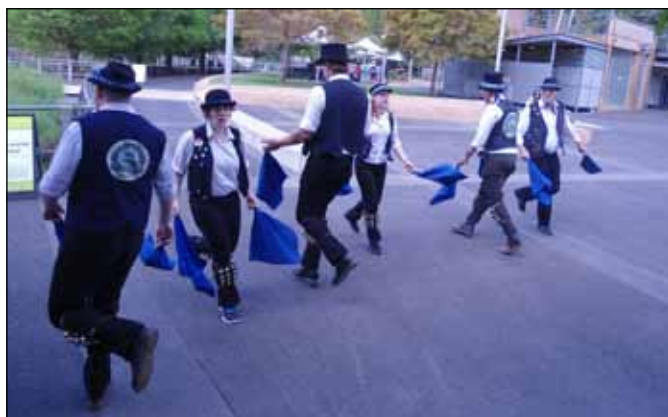
Room Room give me some room!