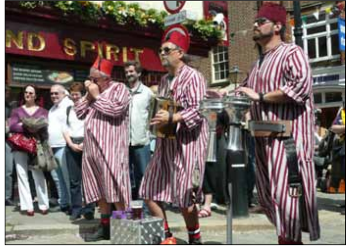
Though it may be here...

veins has now been diluted into meaninglessness. English beer is still a mystery to me, and believe me, I have tried so very hard to like it. I don't see Pommies as "family" and while I absolutely love England and the English, they don't see me as kin either. Yet, we are Australian Morris Dancers dancing English traditional folk dances. And that's not even it. What it is - you see - is we are Australian Morris dancers who just fucking gets it! It could be you, it could be an American, it could be a New Zealander - shit, it could be that Vietnamese Morrisor we saw in Rochester. Here it is, I hope that you are ready for it: Morris Spirit is a universal life force that has evolved to protect and grow Morris Dancing. Yep, friends, we are all - every single dancer - is plugged into the Morris Matrix. Humans are merely a host, but not an accidental host. We are not harbouring any flu virus. We are a chosen host. Morris Dancing has chosen us. Freaky!