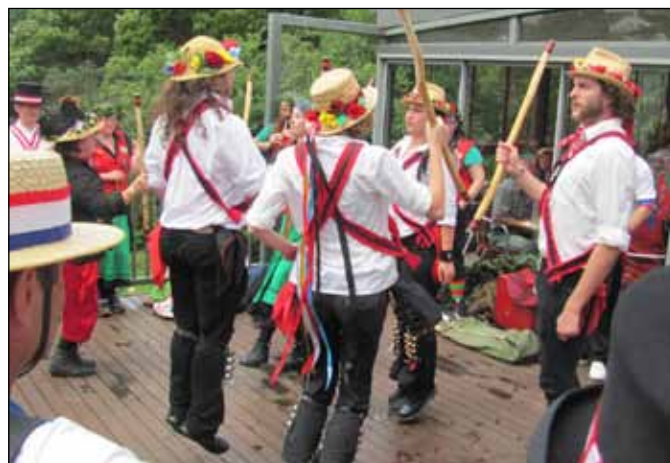
The Joakers at Brandragon's Steam Ale