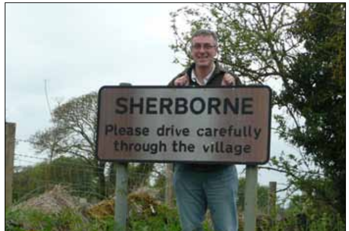
Could it be here?

definitions. MS meant tolerance, acceptance, and inclusion - you know - the Hawk-Keating coda as it applied to multiculturalism. But this is Morris Dancing, not Buddhism (or the centre-left faction of the Labor party). Morris Dancers are individuals, sometimes obnoxious, often self-centred, frequently inebriated and usually display a tendency towards the cynical. In short, typical Morris Dancers – nope, not strong enough - GOOD Morris Dancers are a complex bag of conflicting positive and negative emotive qualities, particularly about their art. The Dalai Lama would never make a good Morris dancer, or perhaps, if he wanted to, he should lose the robe and learn to drink cider. Actually, the Dalai Lama has got a bit of Morris attitude going for him, so maybe he’s not a complete write-off just yet?