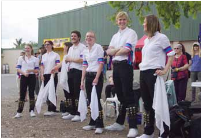
Laughing at the foreman while his back is turned?