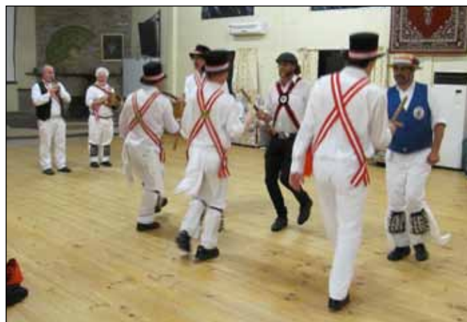
The night time ale ▲